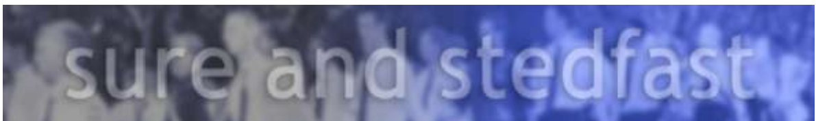
The motto of The Boys' Brigade, selected from Hebrews 6:19 from the King James version of the Bible (hence the spelling) by the Brigade's Founder, Sir William Alexander Smith in Glasgow in 1883.

To apply for a grant, send a simple email with the basic information to bbnrtrust@gmail.com and a form will be sent to you.