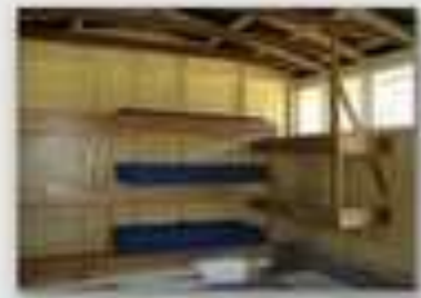
Photos taken during the refurbishment completed in 2010